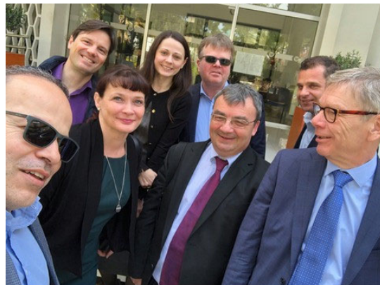
Photo: The latest MAP in Cyprus

Discover participants' experiences in previous