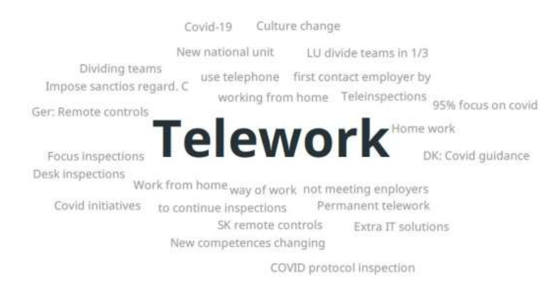
Platform members' responses to a poll on the question "What was the main reform/change introduced in your organisation in the last 6 months to deal with the pandemic's impact?"