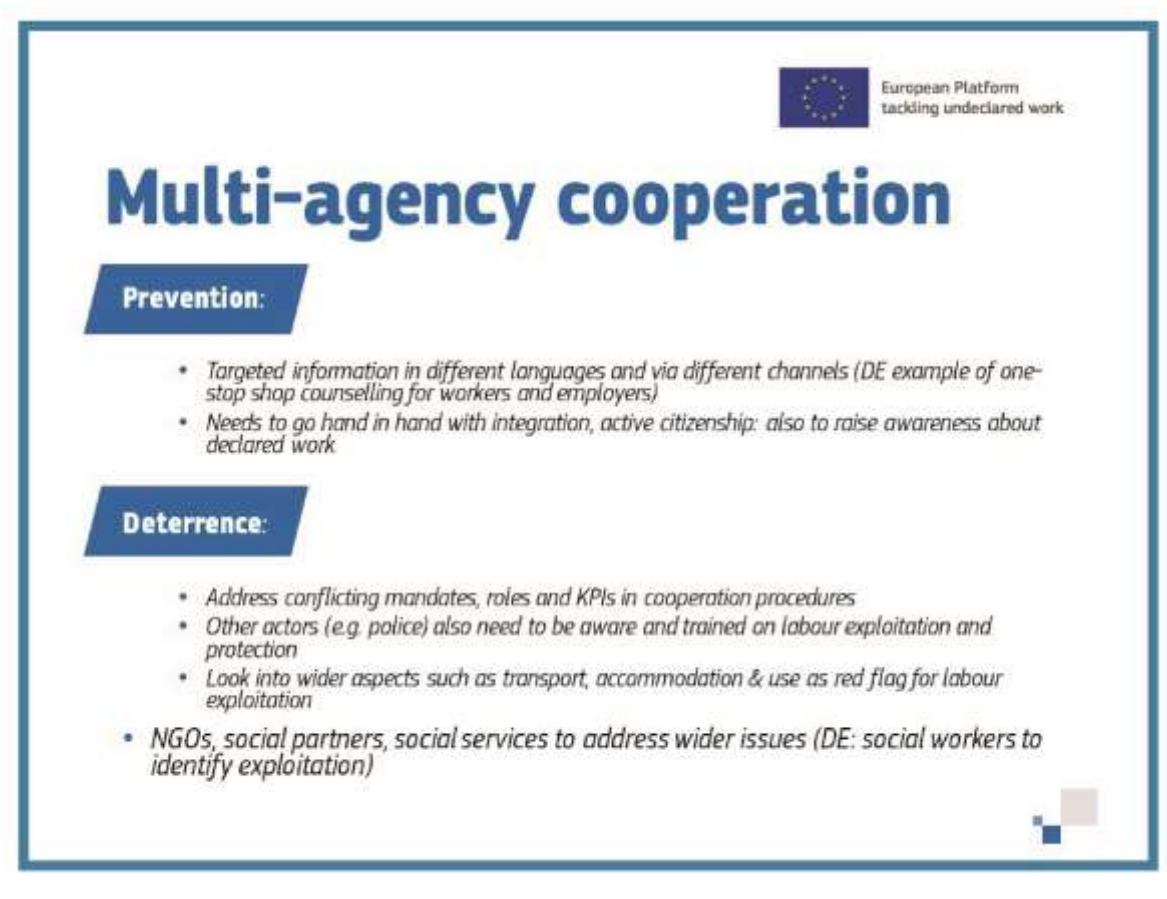
Summary of key points from the discussion on third country nationals presented by a thematic expert

Examples from Platform representatives demonstrate that building trust in authorities is key in counteracting exploitation and undeclared work among workers from third countries. In Italy, labour inspectors collaborate with 'cultural mediators' to improve the confidence of the workers and to reach out to them despite language and cultural barriers. Practices mentioned by the Netherlands and Finland, such as having conversations with workers outside the workplace and away from the employer's presence, or inspectors leaving their business cards, have proven to improve trust. Participants noted it was important to provide information in different languages and via different channels, and highlighted the need to raise awareness about paths to integration and declared work.