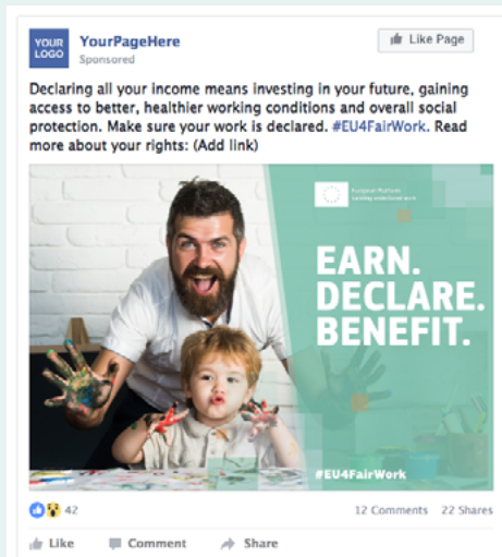
Example of a Facebook post viewed via desktop, with message directed at workers.