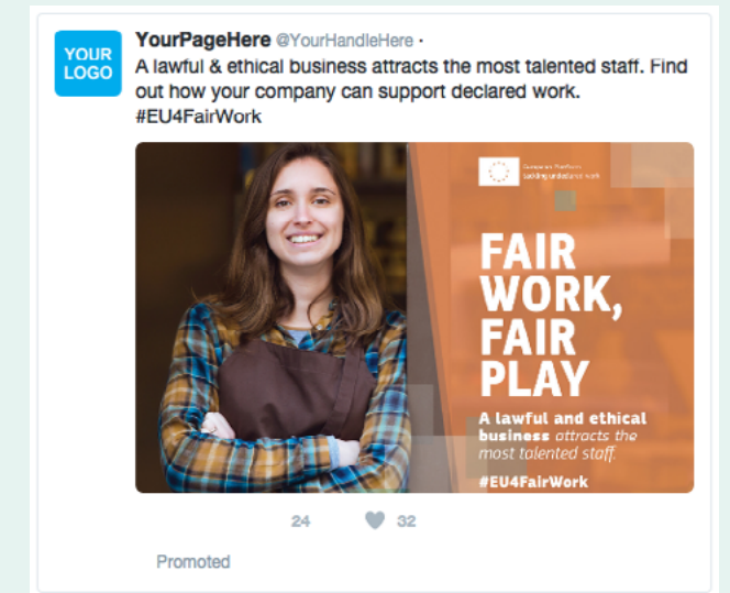
Example of a Twitter post viewed via desktop, with message directed at companies. The post and messaging can link to your national activities by adding a URL link.